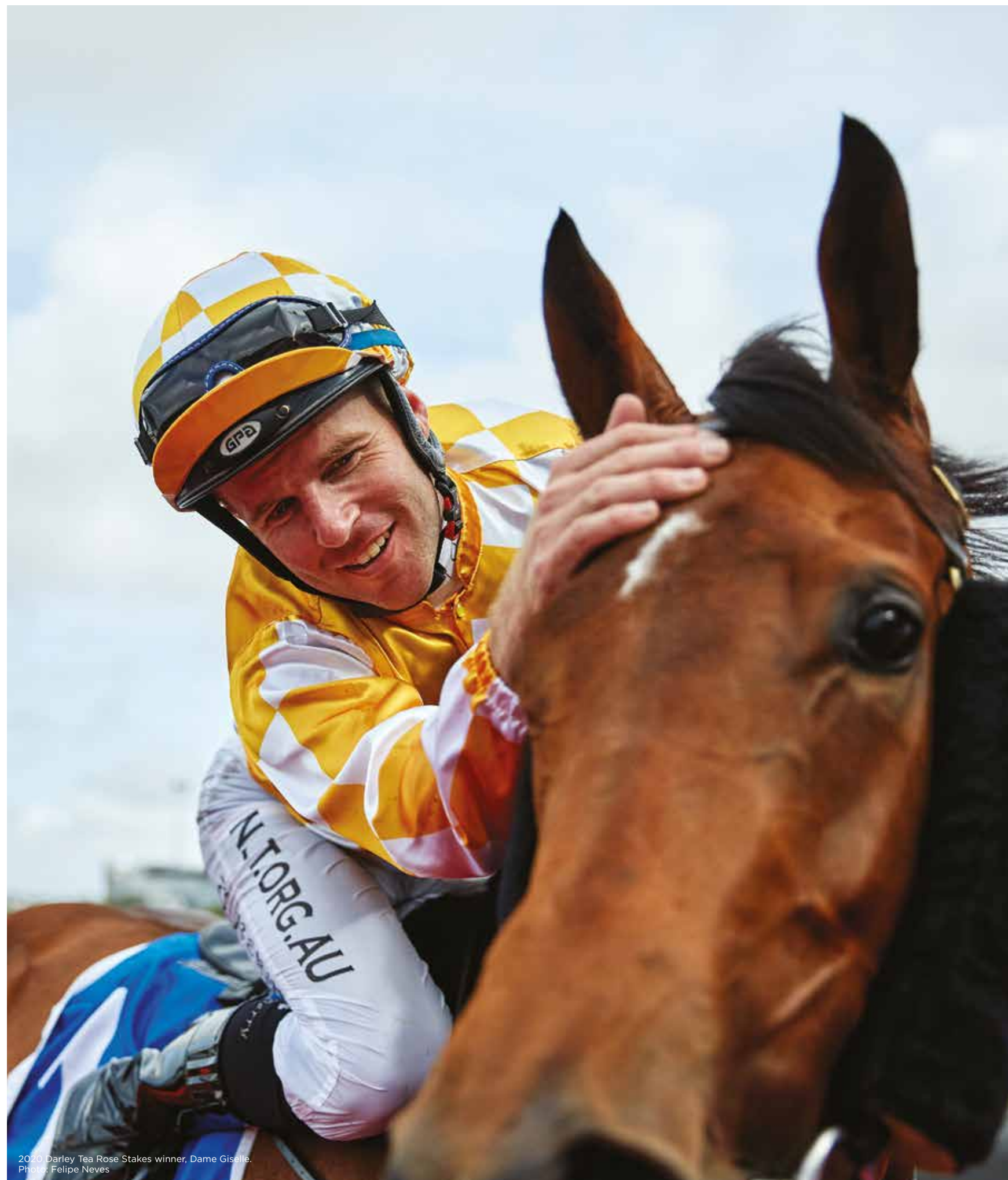
2020 Darley Tea Rose Stakes winner, Dame Giselle.

Final Acceptance 9am, Wednesday 29 September 2021 ($5,775)